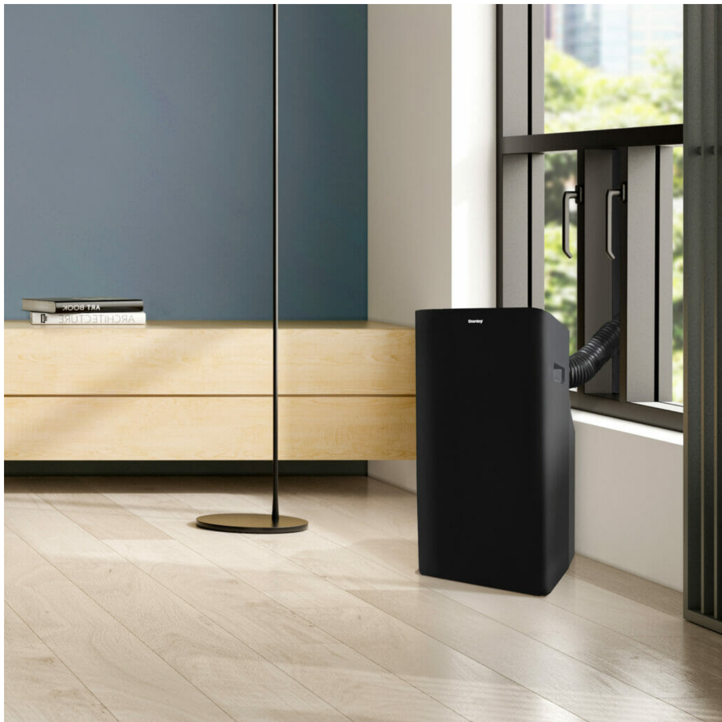
3-in-1 Design: Air Conditioner, Fan, and Dehumidifier