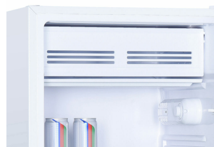
Full width chiller section