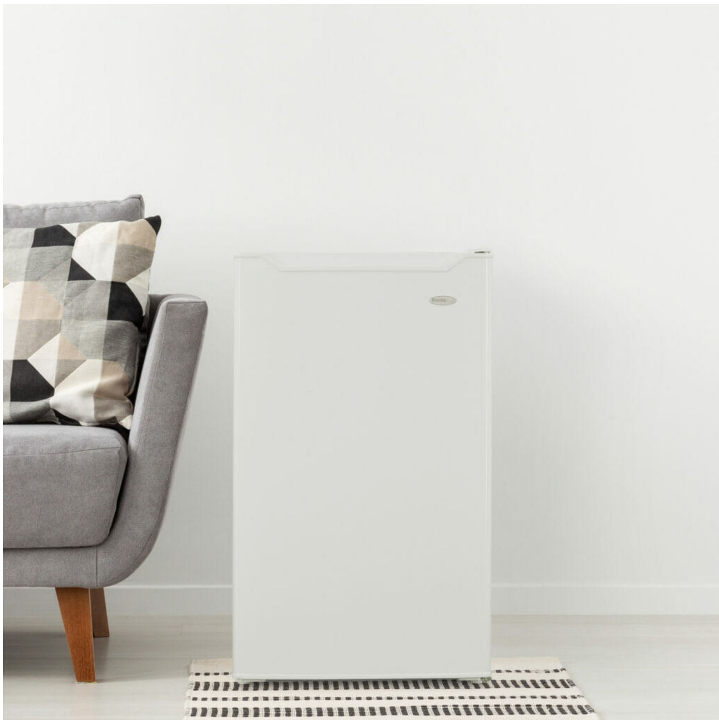
Smooth Back Design