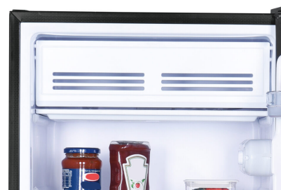
Section refroidisseur pleine largeur