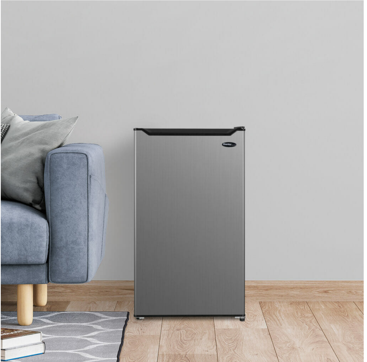
Smooth Back Design