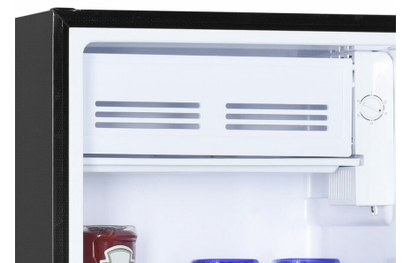
Full width chiller section