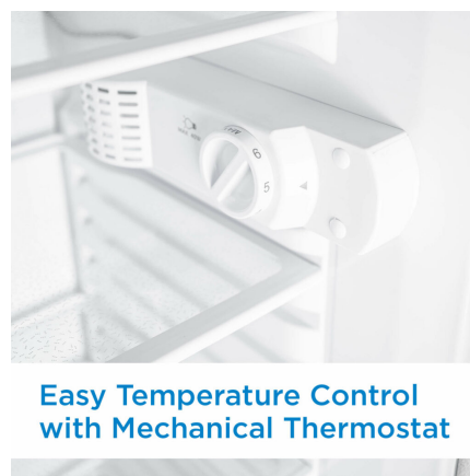
Easy Temperature Control with Mechanical Thermostat