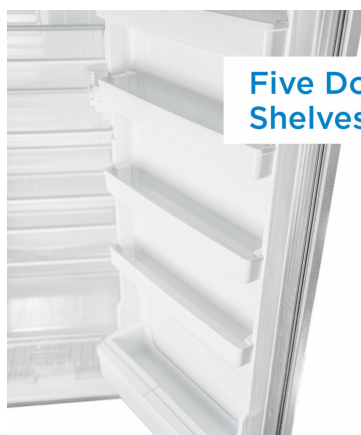
Five Door Shelves