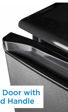
Rounded Door with Integrated Handle