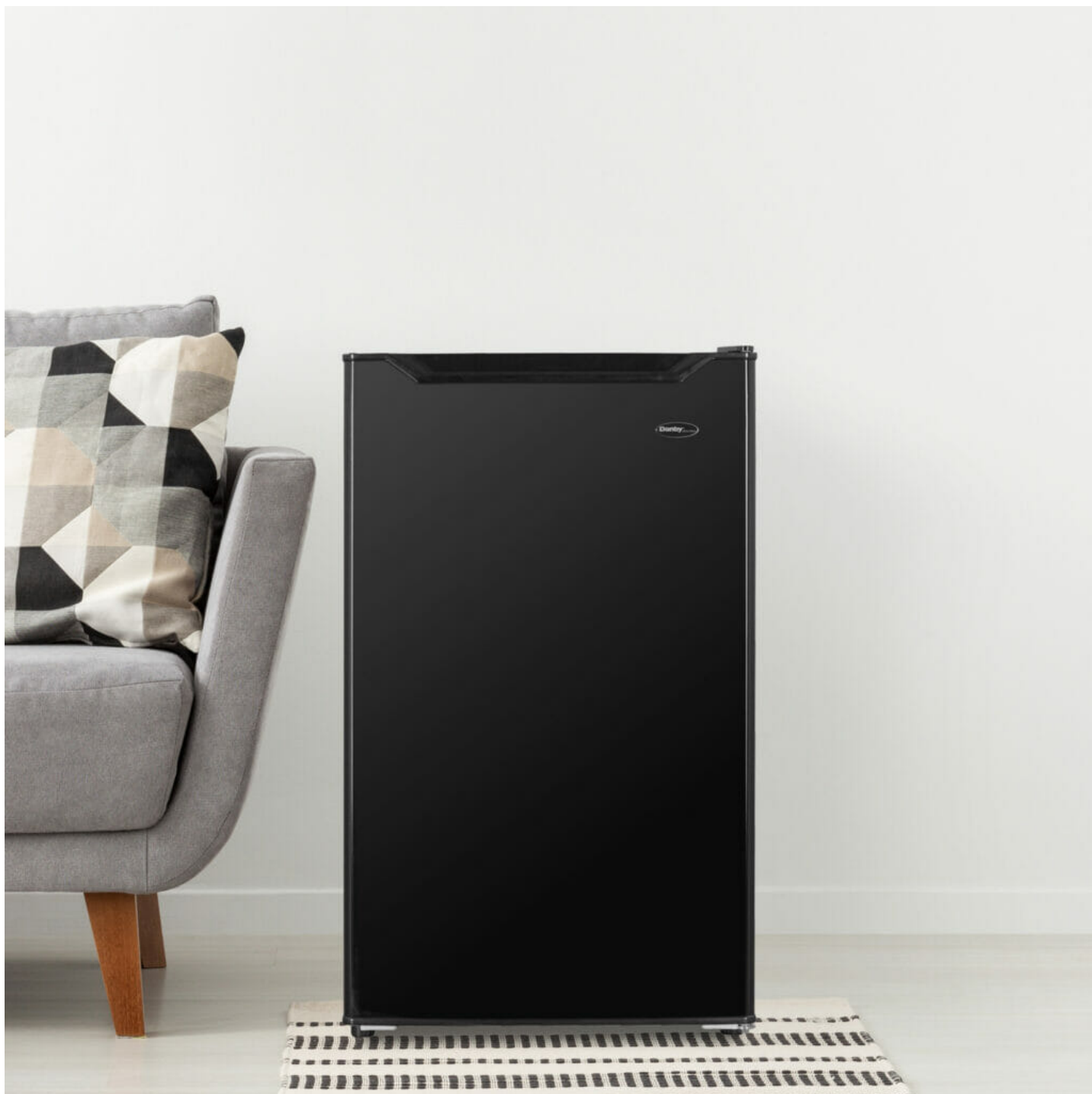
Smooth Back Design