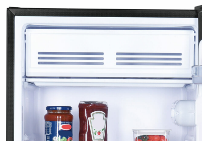
Full width chiller section