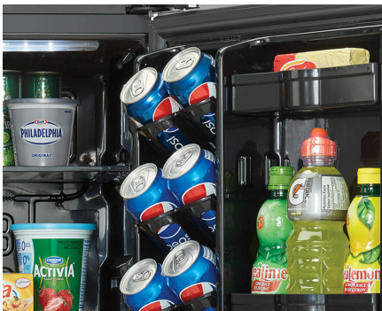
CanStor® Beverage Dispenser