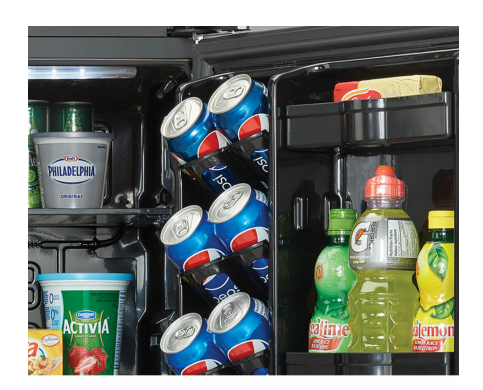
CanStor® Beverage Dispenser